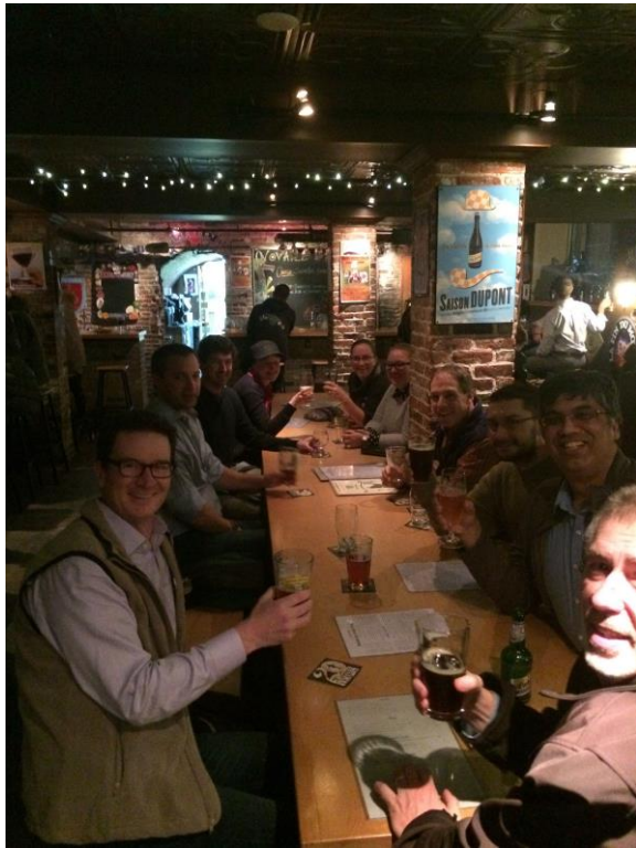
Picture left, attendees at the Maine Mappy Hour at the Nova Res Café, in Portland ME!

Thank you to our attendees in New Hampshire at the Thirsty Moose, Rhode Island, at Doherty's Ale House, in Connecticut, at the Willimantic Brewing Company (following the GIS Day event at Eastern Connecticut University), and in Massachusetts at Harvard University in conjunction with AvidGeo .